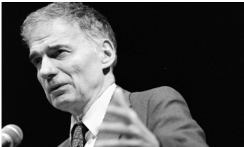
CRUSADING ON CAMPUS US activist Ralph Nader spoke Friday to a full house.